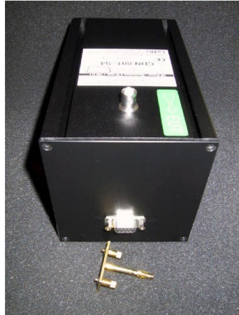
CDN Data 2 twisted pairs screened, D-sub 9 female