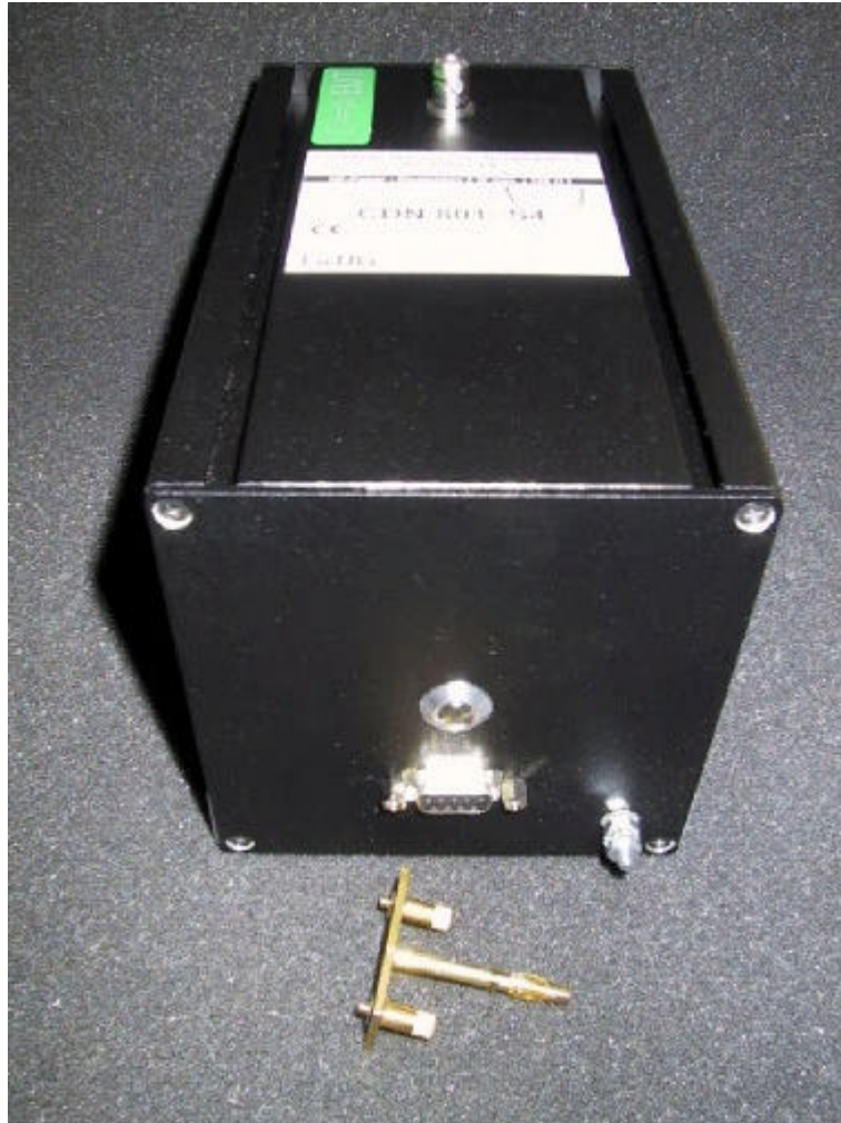
CDN, Daten 2 twisted pair geschirmt, Sub-D Buchse 9-pol.